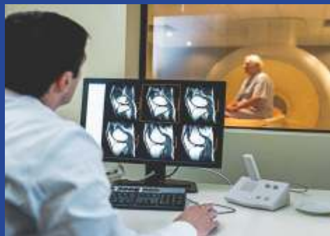
Cross Section Workshop