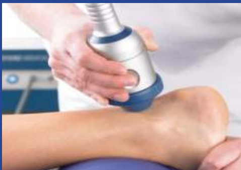
Hands on USG Workshop